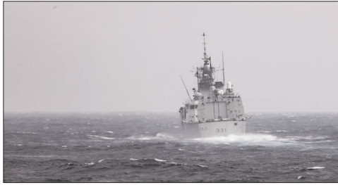
Seventh Fleet said.

The USS Higgins, an Arleigh Burke-class destroyer, in cooperation with the Royal Canadian Navy's Halifax-class frigate HMCS Vancouver, "conducted a routine Taiwan Strait transit September 20 (local time) in accordance with international law", the US Navy's