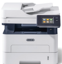
Xerox® B215 Multifunction Printer