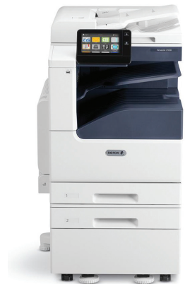
Xerox® B1022 Multifunction Printer