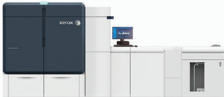
Xerox® Iridesse® Production Press