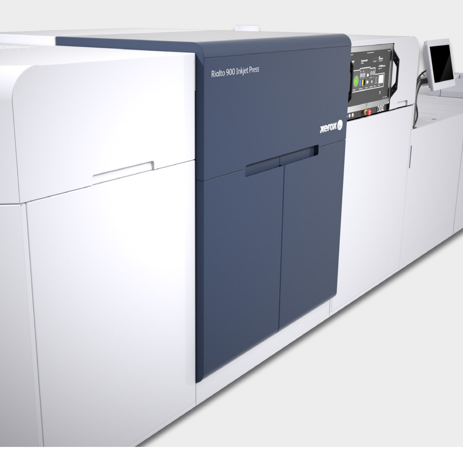
Small. Simple. Scalable.