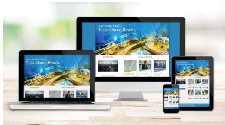
Xerox® FreeFlow® Digital Publisher is a digital publishing software solution that allows you to provide both print and mobile/online communications simultaneously using a single unified workflow.