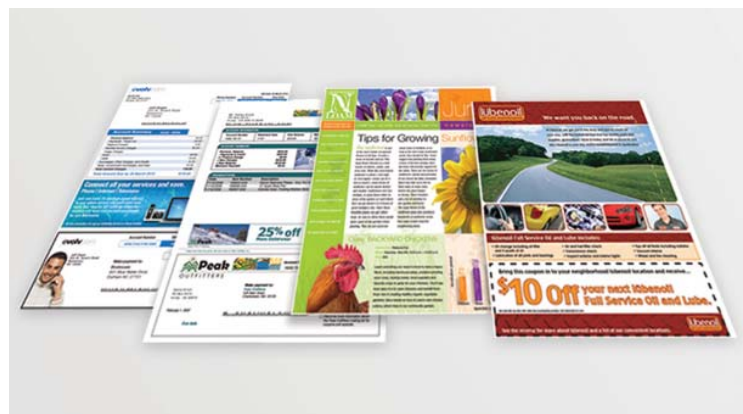
The FreeFlow® Variable Information Suite allows you to personalize your transactional communications quickly, cost-effectively and automatically.