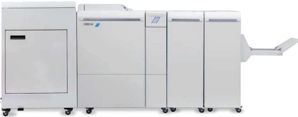
Plockmatic Pro50/35 Booklet Maker, manufactured by Plockmatic International AB

Create professional-quality booklets at rated speed with a compact, affordable inline solution.