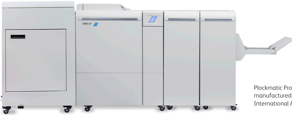
Plockmatic Pro50/35 Booklet Maker, manufactured by Plockmatic International AB

Create professional-quality booklets at rated speed with a compact, affordable inline solution.