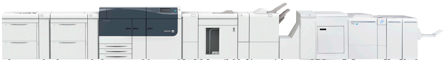
Xerox® Versant® 3100 Press shown with Plockmatic Pro50/35 Booklet Maker

For more information on the Plockmatic Pro50/35 Booklet Maker with Plockmatic RCT, contact your Xerox representative, call 1-800-ASK-XEROX or visit us at www.xerox.com .