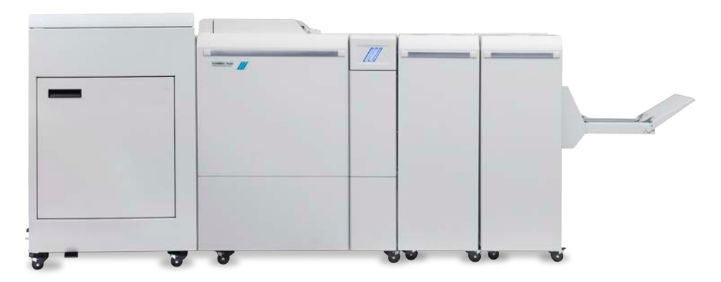
Plockmatic Pro50/35 Booklet Maker, manufactured by Plockmatic International AB

Create professional-quality booklets at rated speed with a compact, affordable inline solution.