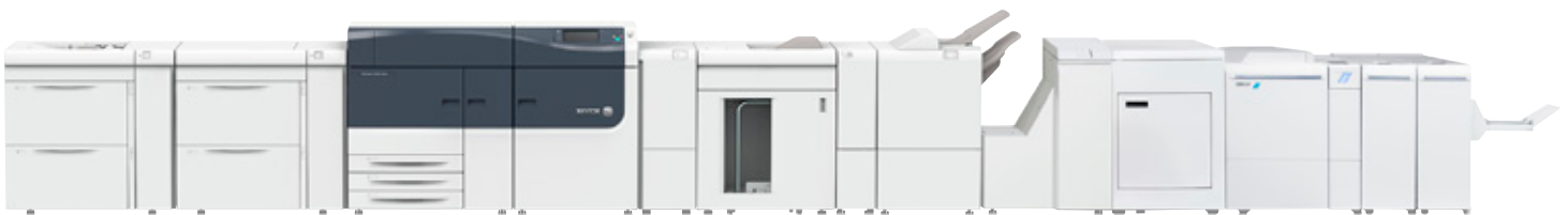
Xerox® Versant® 3100 Press shown with Plockmatic Pro50/35 Booklet Maker

For more information on the Plockmatic Pro50/35 Booklet Maker with Plockmatic RCT, contact your Xerox representative, call 1-800-ASK-XEROX or visit us at www.xerox.com .