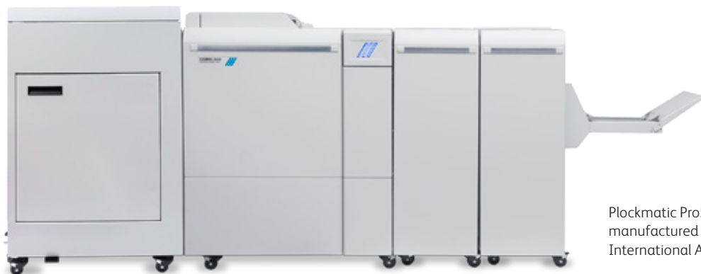
Plockmatic Pro50/35 Booklet Maker, manufactured by Plockmatic International AB

Create professional-quality booklets at rated speed with a compact, affordable inline solution.