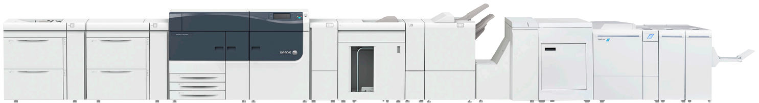
Xerox® Versant® 3100 Press shown with Plockmatic Pro50/35 Booklet Maker

For more information on the Plockmatic Pro50/35 Booklet Maker with Plockmatic RCT, contact your Xerox representative, call 1-800-ASK-XEROX or visit us at www.xerox.com .