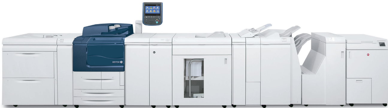
Xerox® D110/D125/D136 Copier/Printer shown with GBC® eBinder 200™

Contact your Xerox representative for a list of supported presses.