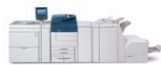
Xerox® Colour C60/C70 Printer

Note: The Xerox® SquareFold Trimmer Module requires the Booklet Maker Finisher and can be used with any of the print servers for the Xerox® Colour 800i/1000i Presses, Xerox® Versant® Family of Presses, Xerox® D Series Copier/Printer or Xerox® D Series Printer and the Xerox® Colour C60/C70 Printer.