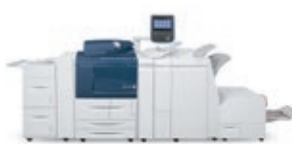
Xerox® D Series Copier/Printer