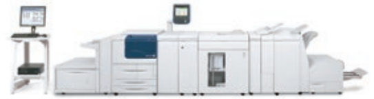
Xerox® D Series Printer