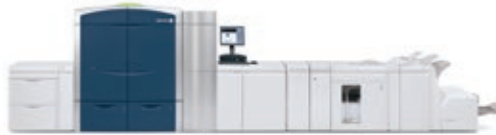
Xerox® Colour 800i/1000i Press