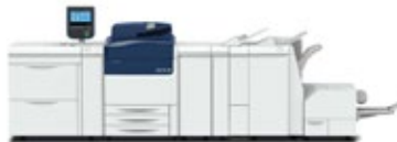
Xerox® Versant® 180 Press