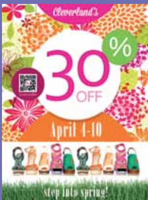
Point of Sale

Producing large quantities of wide format jobs used to be a trade-off , requiring multiple printers and multiple days to fulfill even a single customer request. It's no wonder that these jobs have sometimes been viewed as a problem. But with the Xerox Wide Format IJP 2000, they are a profit opportunity.