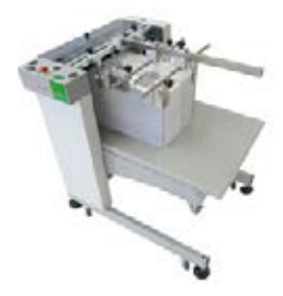
Multigraf PST-52 Stacker