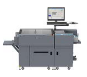
Duplo® DC-745 Slitter/Cutter/Creaser