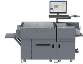
Duplo® DC-745 Slitter/Cutter/Creaser

The DC-745 Slitter/Cutter/Creaser is Duplo's most powerful all-in-one digital color finishing solution. Taking the success of the popular DC-645 model to the next level, the DC-745 is the ideal companion for mid- to high-volume production digital printers. Offering greater speed, productivity and versatility, the DC-745 not only processes jobs faster but also finishes a wider range of digitally printed applications in a single pass. The DC-745 comes loaded with new features, including a higher feed capacity and a PC controller for easy job setup, as well as a range of optional modules for scoring and perforating, enabling users to go beyond basic finishing.