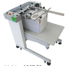
Multigraf PST-52 Pile Stacker

There are two models of the Multigraf Stacker. The Short Version can be attached to the iGen to enable stacking of sheets up to 26" (660 mm). The Long Version has enhanced stack quality and stacking capacity of coated sheets up to 22.5" (572 mm) and also includes a cooling device as an inline output solution. The cooling device dries varnished sheets to improve stacking quality.