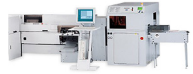
Xerox® Automated Book Factory Solution

The Xerox® Automated Book Factory Solution is a complete solution to grow your business to include book publishing. Documents are printed, collated and perfect bound in a seamless production process—emerging from the system ready to be packed and shipped. The ability to switch from inline to offline at the push of a button and optionally transform A4-size sheets into perfectly bound A5 books makes the Manual+Book Factory the ideal perfect binding system for both commercial and in-plant printers looking to expand their finishing repertoire while keeping costs down and meeting tight turnaround times.