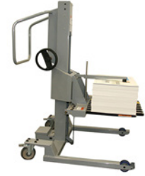
Production Media Cart

Experience a powerful combination of efficiency and convenience in a solution built for the professional, safe transportation of printed media from the stacker to work tables, pallets or nearline/offline finishing. The Power Eject unit uses a drive system to safely eject large stacks from the printer's stacker to the Production Media Cart. The Production Media Cart uses a battery-powered vertical elevation system to set the media table height and a hand crank to transfer the paper stack from the cart.