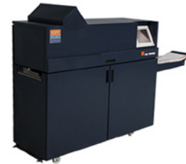
C.P. Bourg® BDF-e

The BDF-e can top or corner stitch from 2 to 50 sheets and it can also be used in the fold-only mode. The BDF-e is touchscreen controlled and requires absolutely no tools for changeover in sheet size or application. A complete paper path sensing system ensures that document production is monitored throughout each step of the process. It includes an easy load, self-threading wire stitching cassette that automatically produces over 50,000 stitches and even adjusts for various book thicknesses. Other features include a dual roller folder that ensures sharp, square, accurate folds and automatic sizing that utilizes a self-sharpening two-blade trimmer.