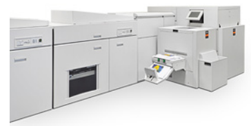
Watkiss PowerSquare™ 224

A complete book making system, the Watkiss PowerSquare 224 combines the four processes required to produce quality manuals: stitching, folding, spine forming and trimming. This finisher produces Watkiss SquareBack™ books up to 1"/10.4 mm (224 pages/56 sheets at 70 gsm). It features fully automatic settings and includes a six-position single stitch head that allows for a variable stitch leg length to accommodate for varying book thicknesses. A cost-effective alternative to perfect binding or tape binding, the Watkiss PowerSquare 224 will automatically adjust itself based on sheet count to provide the most accurate stitch length and fold depth—on the fly—to easily accommodate a variety of jobs.