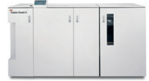
GBC® FusionPunch® II

The GBC FusionPunch II prepares documents for coil binding by punching and stacking a wide range of stocks with the speed, quality and reliability you need for high-volume production. This inline punch solution features an outstanding paper handling system that maximizes uptime and reduces skewing with remarkably consistent registration. It even handles challenging jobs with intermixed stocks, index tabs and lighter stocks that have traditionally been difficult to finish.