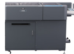
Duplo® DC-645 Slitter/Cutter/Creaser

Accepted sheet sizes are 8.26" x 8.26" to 14.56" x 25.59" (210 x 210 mm to 370 x 650 mm) with paper weights of 110 to 350 gsm (80 lb Text to 130 lb Cover). Paper types are text, uncoated, coated and laminated.