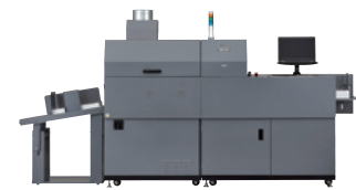
Duplo® DDC-810 Offline UV Spot Coater

Differentiation for high-quality prints is a premium, and no longer available only to the production market! The Duplo DDC-810 is an offline UV spot coater targeted toward mid- to entry-production arenas. Compact and user friendly, it achieves precise, valued UV coating by an accurate CCD reading system and inkjet control. Add value to your print with a layer of spot UV embellishment that you can touch and feel.