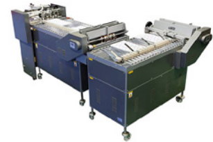
Rollem JetSlit System