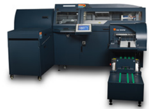
C.P. Bourg® 3202 Perfect Binder

The BB3202 can also make 13 positive or negative high-quality creases utilizing a knife-creasing technology that offers superior results and greater flexibility compared to conventional wheel-scoring, including the ability to create winged book jackets.