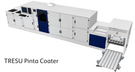
TRESU Pinta Coater

The TRESU Pinta is an innovative, inline coating solution for digital sheet-fed folding carton production. It is completely modular and designed for seamless integration with Xerox® iGen® presses. Both water-based and UV varnishes can be used for a wide range of applications, including pharmaceutical, media, food and confectionery, cosmetics, consumer electronics, promotional, gifts and more. The TRESU Pinta and Xerox® iGen press offer a complete digital print folding carton production line for printing, full surface or selective coating and stacking. With a flexible and quick sleeve change process, changeover is possible in less than five minutes, enabling production of any size job from very small runs to large-scale production.