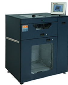
C.P. Bourg® Sheet Feeder (BSF)

The BSF includes two separate feeding compartments: a lower high-capacity tray that can accommodate pile heights up to 20" (508 mm) and an upper feed drawer that accommodates pile heights up to 6.3" (160 mm) of cover or insert sheets. When in bypass mode, the upper feed tray can be used as a cover feeder. A hand scanner is used to read JDF data from job-specific printed banner sheets that travel with the stacks. The BSF is equipped with OMR (optical mark recognition) and double- and missed-sheet detection from both compartments. It also detects when either tray is empty.