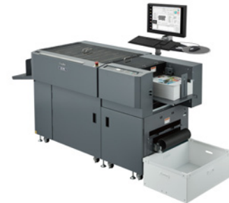
Duplo® DC-746 Slitter/ Cutter/Creaser

The DC-746 Slitter/Cutter/Creaser is the ideal companion for digital printers with medium to high production jobs. Performing up to 10 slits, 25 cuts and 20 creases in one pass, this digital color finisher eliminates white borders and toner cracking on fold lines, producing professionally finished documents in a matter of minutes. The DC-746 offers optional rotary tool and cross-perforation modules, both with strike perforating capabilities, for increased versatility. Produce 24-up and 36-up business cards, slit-score greeting cards, micro-perforated coupons, direct mailers with perforated cards and much more!