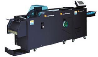
C.P. Bourg® BM-e Booklet Maker

The new generation inline Bourg Booklet Maker Enhanced (BM-e) is the first booklet maker that can handle a sheet size of 14.33" x 22.5" (364 x 571 mm). Oversize sheets can be folded and saddle stitched to create impressive 14.33" x 11.25" (364 x 286 mm) brochures, calendars or other booklets. Smaller booklets can be printed two-up to increase productivity with additional stitch heads. Booklets can be 2 to 30 sheets (75 gsm). The BM-e accepts coated or uncoated 60 to 350 gsm paper in sizes from 5.8" x 8" (147 x 203 mm) to 14.33" x 22.5" (364 x 571 mm).