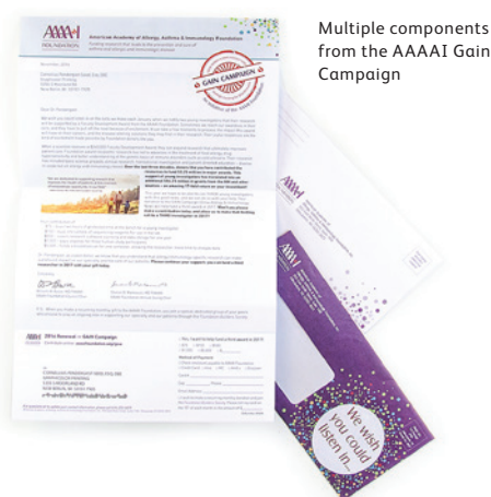
Multiple components from the AAAAI Gain Campaign

Graphicolor found a solution with FreeFlow Core, reducing three different time-consuming manual operations into a seamless, automated sequence. The new workflow uses the Split feature, part of FreeFlow Core’s Advanced Automation module, to separate each of the job’s various deliverables into the appropriate page size based on branch conditions. From there, FreeFlow Core automatically imposes and routes to the press.