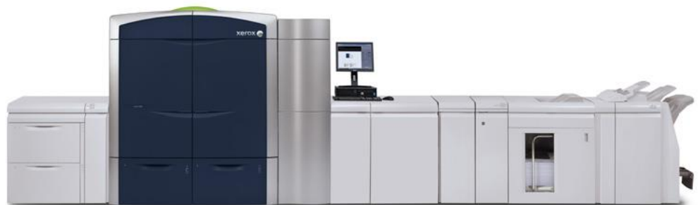
Figure 4: Xerox® COLOR PRESS 1000