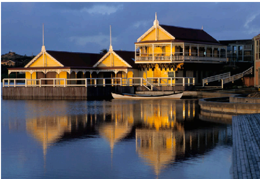
Figure 2: Image after application of the transform 'very-strongly more saturated'.

The standard dictionary of color names used in this application is based on the NBS-ISCC standard color name dictionary 1-3 . We have supplemented this dictionary with several additional names for neutral gray colors. The NBS-ISCC dictionary consists of 267 color names. The names are structured and composed of between 1 and 3 words. At the most fundamental level there are simple one-word color names such as red, green, yellow, blue, black etc. At the next level there are hue modifiers attached to these fundamental color names. This gives colors such as yellowish-green, reddish-blue, purplish-red etc. At the next level are modifiers that distinguish levels of lightness and colorfulness. These modifiers include words like dark, light, pale, vivid, deep etc.