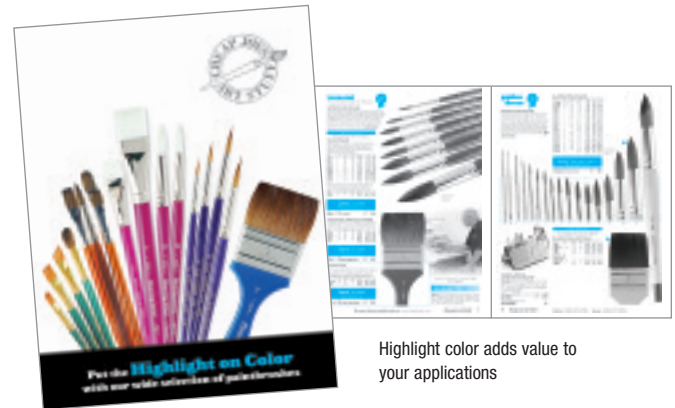
Highlight color adds value to your applications

Highlight color provides you with the power and flexibility to create high-value, high-impact applications that get results.