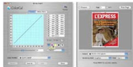
ColorCal Expert Tools