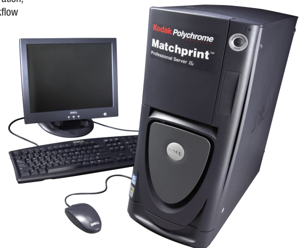
Kodak Polychrome Graphics Matchprint Professional Server