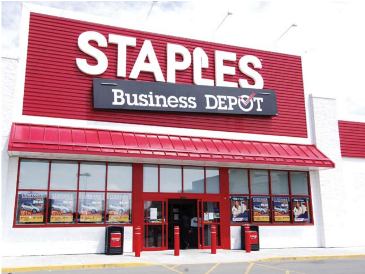
STAPLES Business Depot