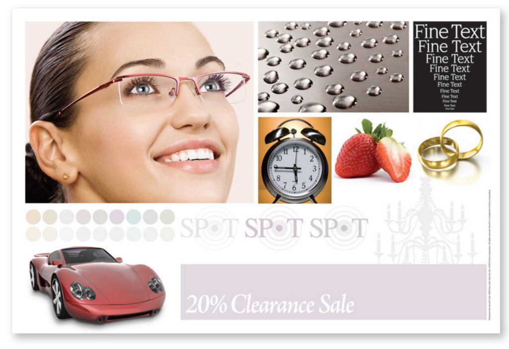
Base image without Clear Dry Ink areas.

The creative options you can offer by adding this new, Clear Dry Ink capability can help you become a true partner to your customers. You can advise customers already expert in design and layout on how to set up their files properly for this addiitonal clear layer to achieve their desired effect. Or you can offer creative value to customers when they deliver their files, by adding some of these effects right at your print server.