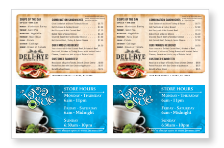
Image quality, ease of use, productivity, media latitude, feeding and finishing options, plus world-class workflow solutions are at your fingertips. Grow your digital color printing capabilities and reduce costs with the Xerox® Color 560/570 Printer.