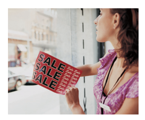
Xerox® NeverTear Window Signs

With our special polyester EA Low Melt Toner, the output fuses to polyester in a chemically bonding way, ensuring outstanding image quality on specialty substrates such as polyester and more – allowing you to offer a broader set of media choices. Premium NeverTear is water, oil, grease and tear resistant.