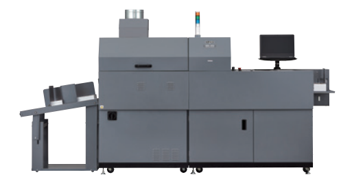
Duplo® DDC-810 Offline UV Spot Coater