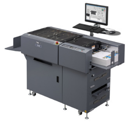
Duplo® DC-646 Slitter/Cutter/Creaser