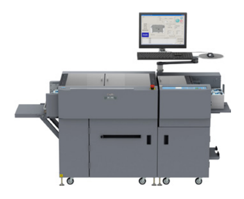
Duplo® DC-745 Slitter/Cutter/Creaser