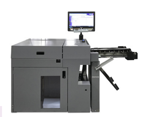
Duplo® UD-300 Rotary Die Cutter