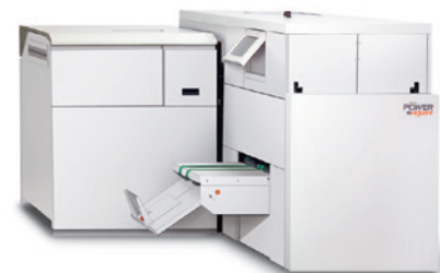
Watkiss PowerSquare™ 224