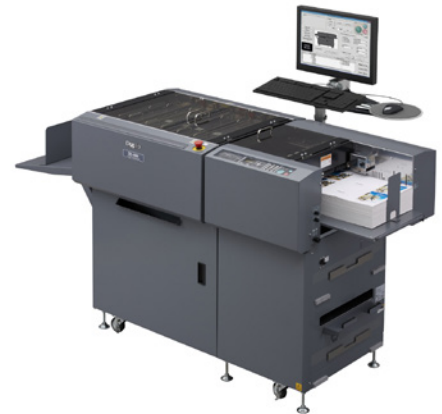
Duplo® DC-646 Slitter/Cutter/Creaser