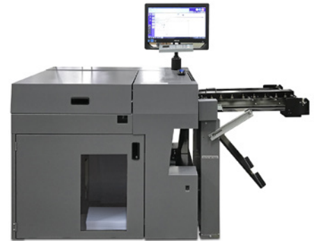
Duplo® UD-300 Rotary Die Cutter