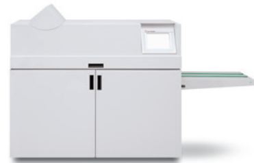
C.P. Bourg® BDF-e with Square Edge