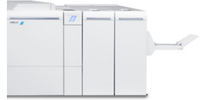
Plockmatic Pro 50/35 Booklet Maker